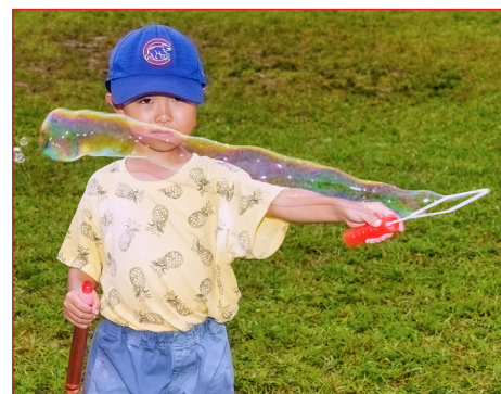
Photos from the very rainy 2023 picnic

Organized by the member organizations of the Chicago Japanese American Council, Tohkon Judo Academy and community friends.